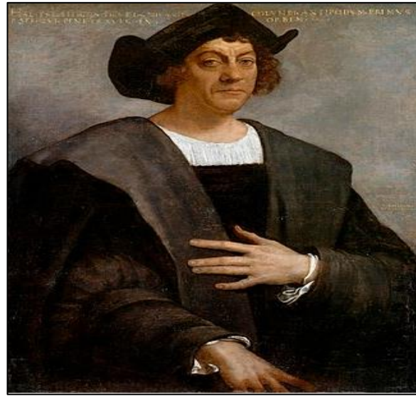
A portrait of Christopher Columbus from 1519

Many people at the time believed that the world was flat. Columbus aimed to prove that Earth was round.