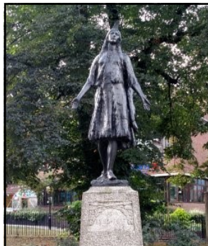
The statue of Pocahontas in the yard of St George's Church, Gravesend

Today, some of the descendants of the original American Indians live on reservations. These are areas of land set aside specifically for Native Americans. This helps to protect their heritage and culture. However, only around 30% live on reservations. The rest live outside the reservations just like anyone else.